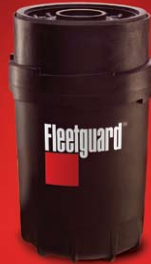
The User-Friendly Filter's flat bottom allows it to stand up.